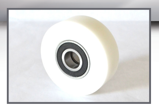
Nip Wheel-White Delrin 1" Wide