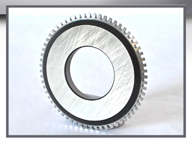
* Press fit high-quality, double sealed, low friction bearing installed — Add $5.00