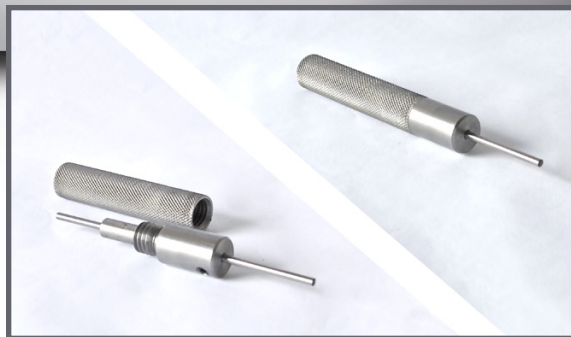
Stripper Pin Removal Tool