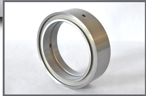
Shear Slitter Anvil Knife 6.30" OD

Walt Powley Inline, Inc. anvil knives are manufactured to exacting tolerances from high quality D2 tool steel.