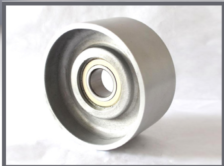
Support Roller – 3.12" Wide

For use with Scheffer plow folding equipment with a 6" support roller diameter