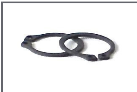
Snap Ring / Nip Wheel Axle