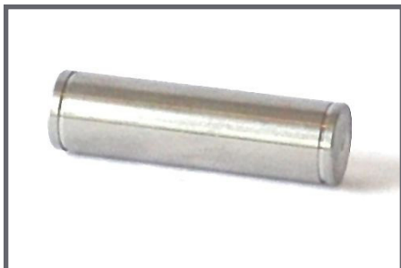
Axle / Nip Wheel