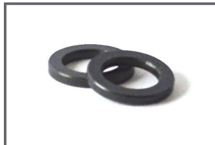
Washer / Nip Wheel Axle